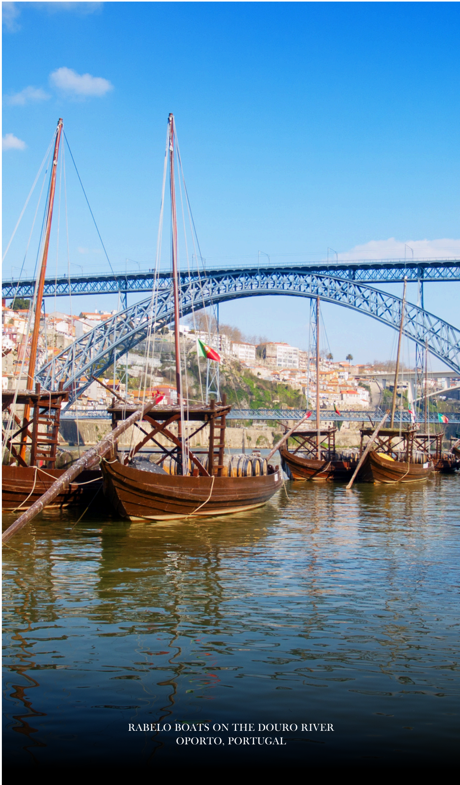
RABELO BOATS ON THE DOURO RIVER OPORTO, PORTUGAL