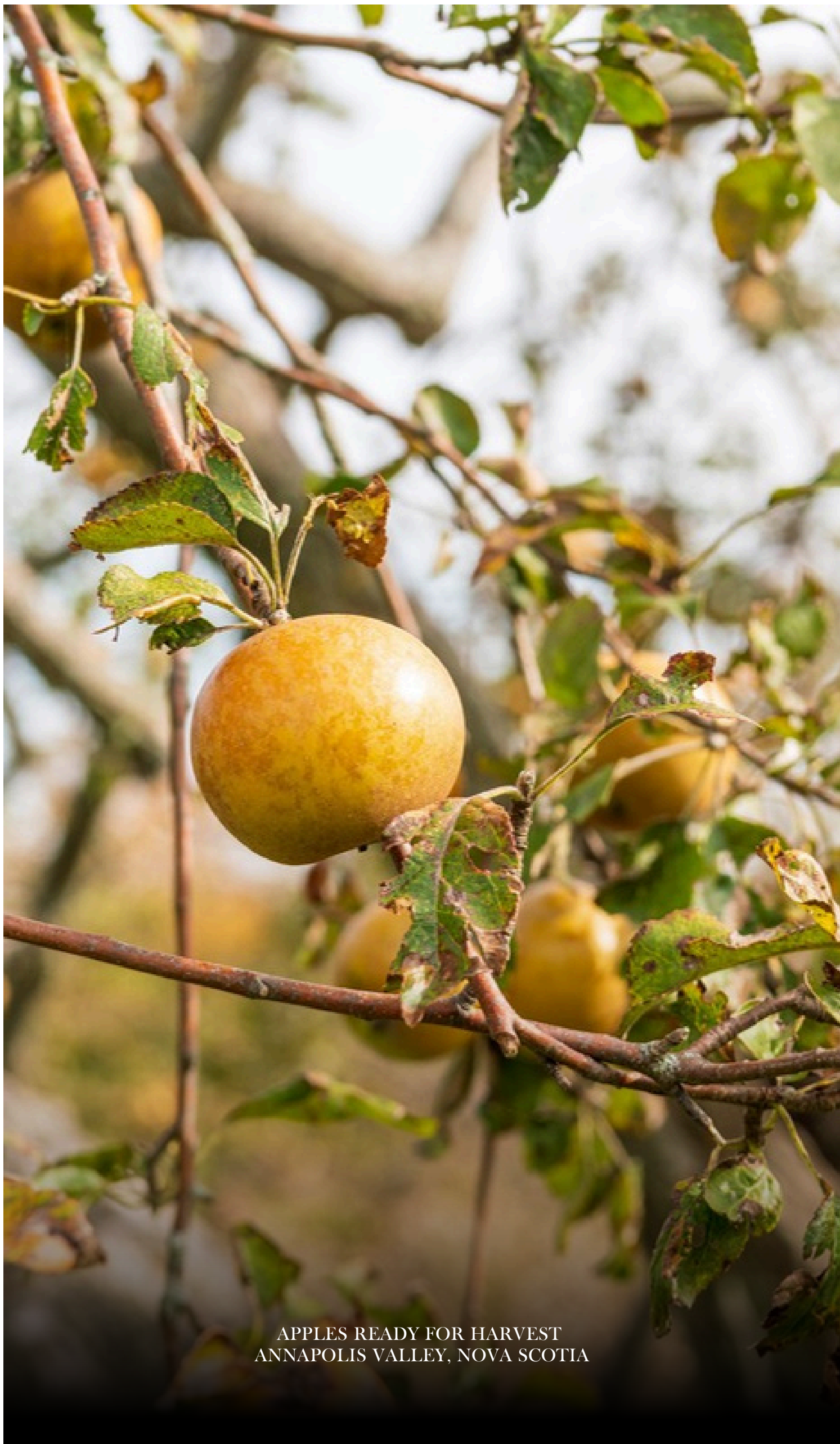
APPLES READY FOR HARVEST ANNAPOLIS VALLEY, NOVA SCOTIA