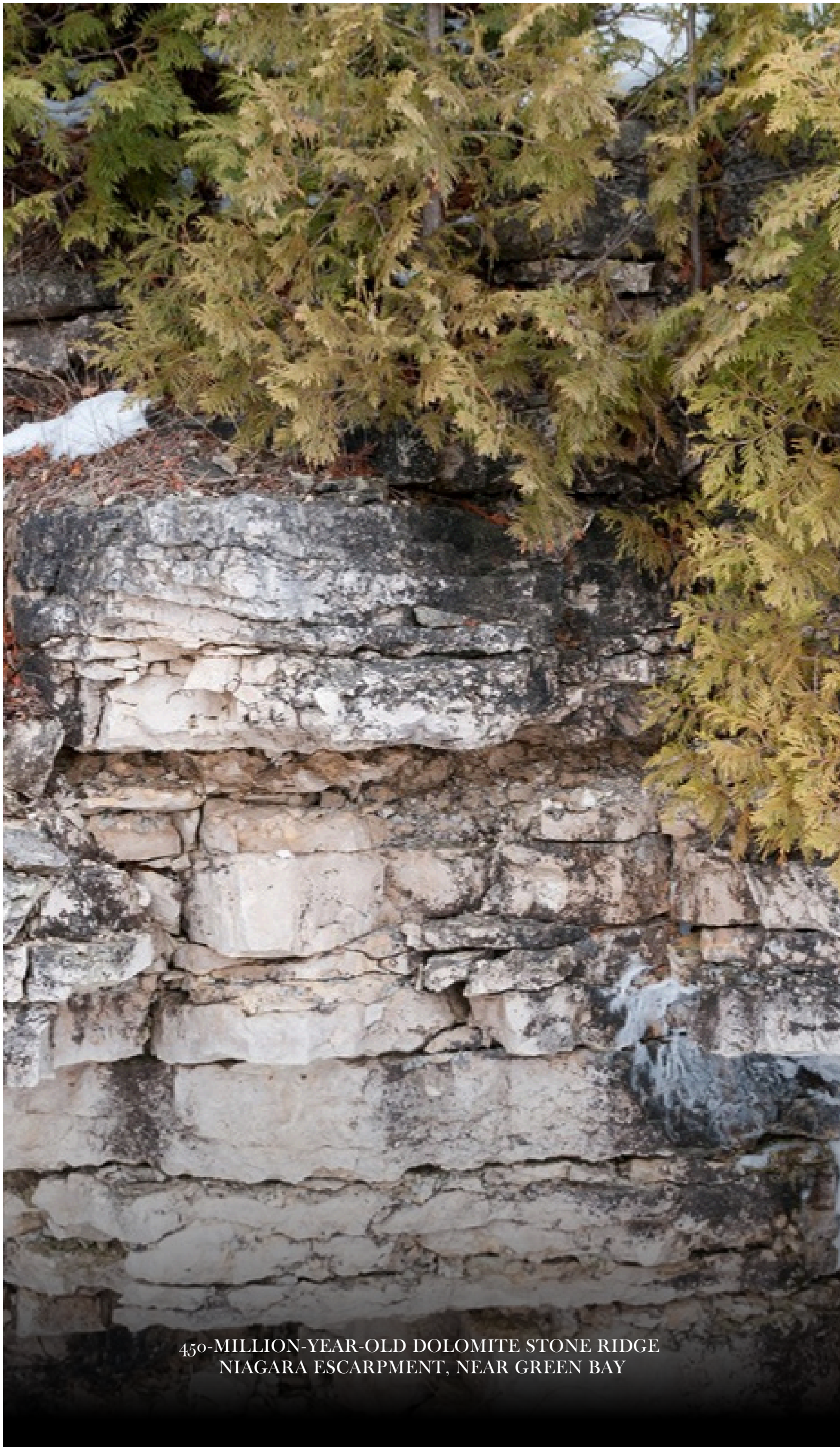
450-MILLION-YEAR-OLD DOLOMITE STONE RIDGE NIAGARA ESCARPMENT, NEAR GREEN BAY