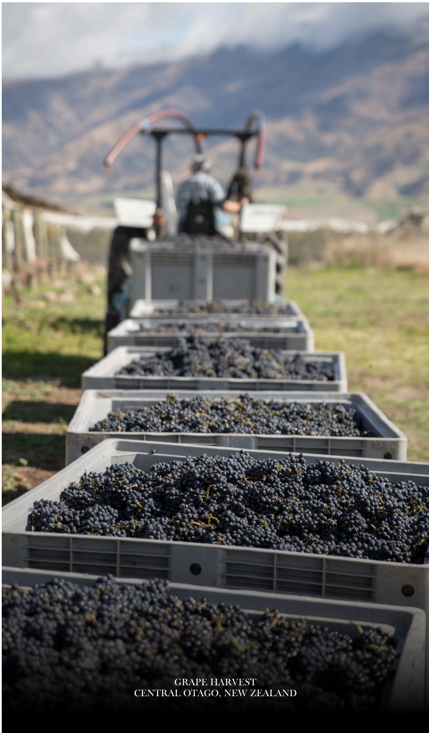
GRAPE HARVEST CENTRAL OTAGO, NEW ZEALAND